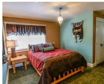
2nd Level Bedroom (2)