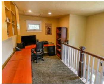
Second Level Work Space