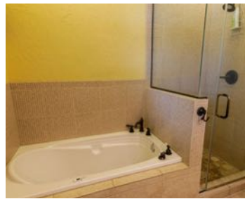
Jacuzzi Tub & Shower