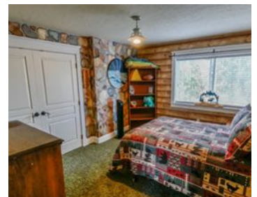
2nd Level Bedroom (3)