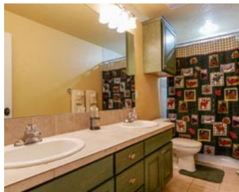
2nd Level Full Bath