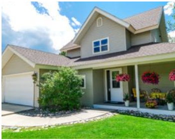
27389 Brandon Circle