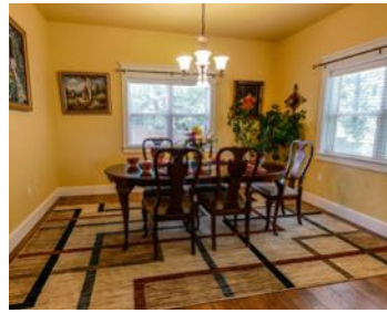
Dining Room Area