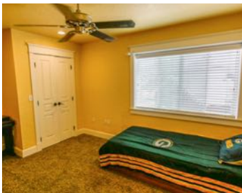
2nd Level Bedroom (4)