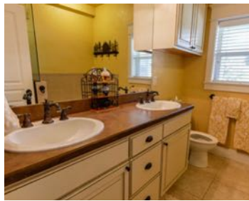
Master Bath - Dual Vanity