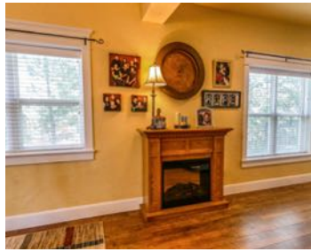
Great for Entertaining