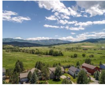
View of Ski Mountain