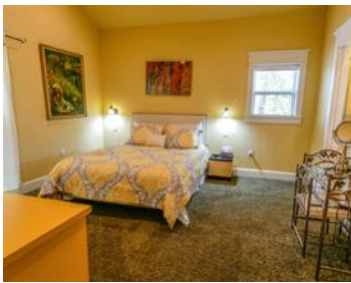
Master Bedroom (1st Level)